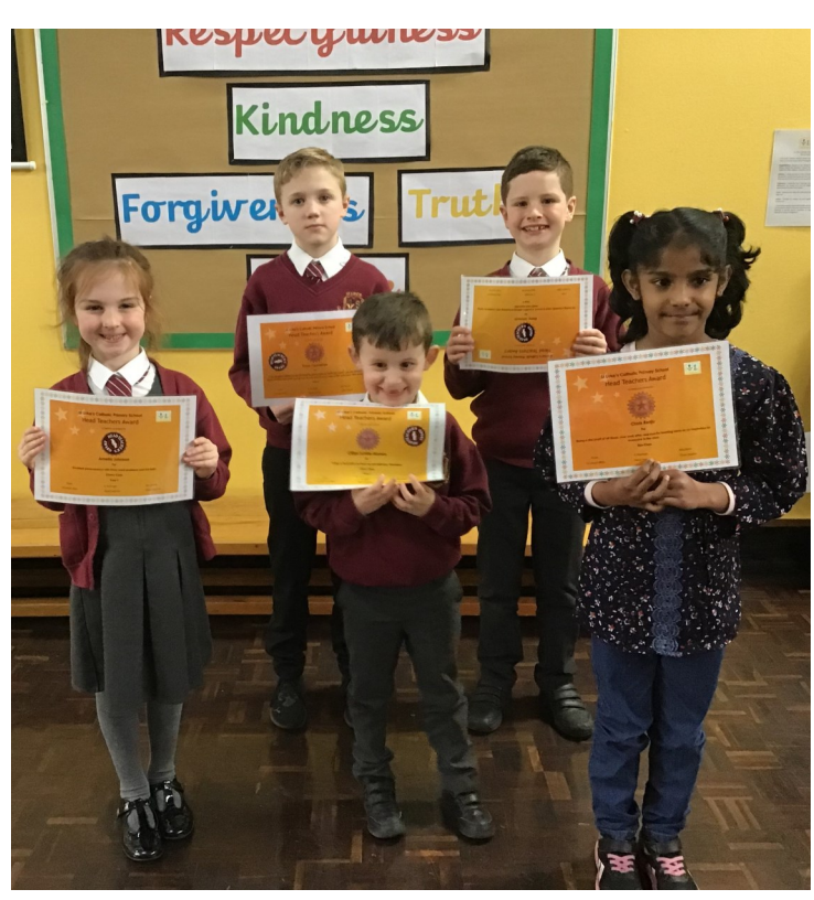
Subject Awards Pride Awards